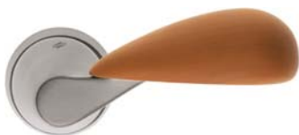
NI/PE Nikelmat/Pero Matt nickel/Pear wood