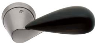
NI/EM Nikelmat/Ebano makassar Matt nickel/Makassar ebony